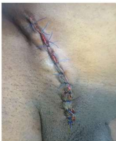
Fig.1 Clinical photograph of the herniorrhaphy wound 3 days post-operationshowing swelling and extravasation of urine.